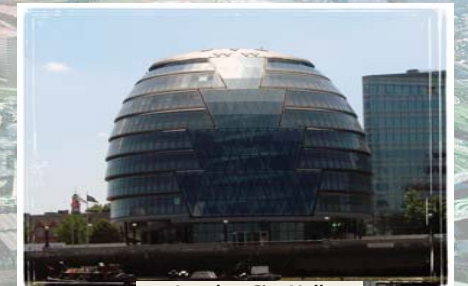
London City Hall