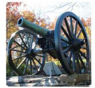
Lookout Mtn., TN