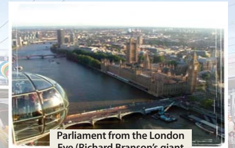
Parliament from the London Eye (Richard Branson's giant Ferris wheel on the Thames)