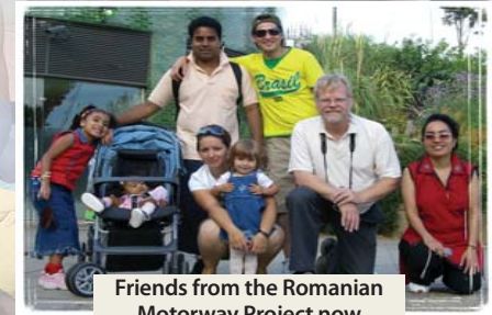
Friends from the Romanian Motorway Project now reassigned to London